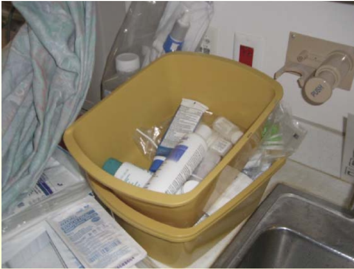
Figure Typical storage of bath basin. Note upright storage, sink, and used incontinence tubes.

the direct exposure to the bacteria that can occur if a contaminated basin is used for bathing. It is reasonable to anticipate that patients who are immunocompromised or who have open wounds would be at risk for infection after direct exposure to contaminated bathing materials. Any activity that potentially spreads antibiotic-resistant bacteria from a contaminated surface to the skin works directly against efforts to eradicate such bacteria from the hospital or health care environment.